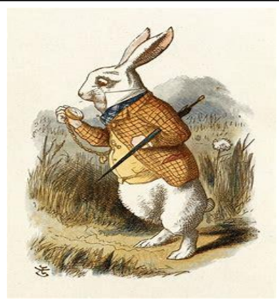
The White Rabbit