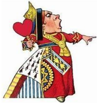
The Queen of Hearts