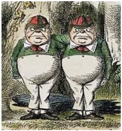
Tweedle Dum & Tweedle Dee

Can you name the Wonderland characters below?