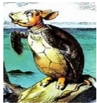
The Mock Turtle