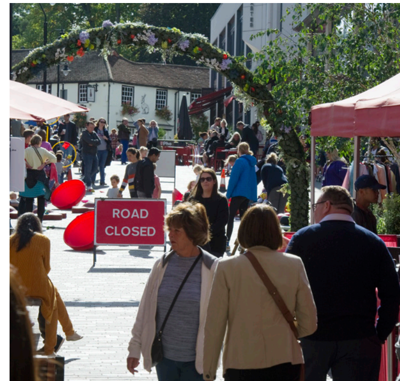
Car free day, Guildford