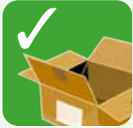
Dry paper and cardboard

Clean and dry recycling, collected fortnightly