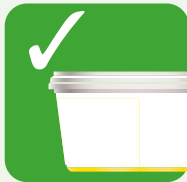
Plastic pots, tubs and trays