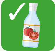
Glass bottles and jars