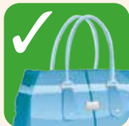
Bags and belts