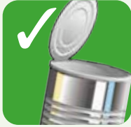
Metal tins and cans