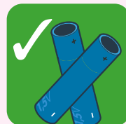
Batteries in a separate bag