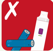
Batteries and vapes