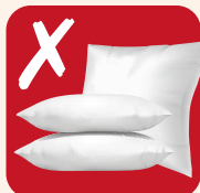
Pillows and duvets

Remember, items must be clean, dry and in no more than one small, tied carrier bag placed next to your bin.