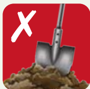
Soil and stones

Remember, to subscribe to the garden waste collection service or to find out more about composting at home, visit www.guildford.gov.uk/gardenwaste .