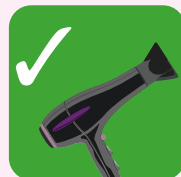
Anything with a plug